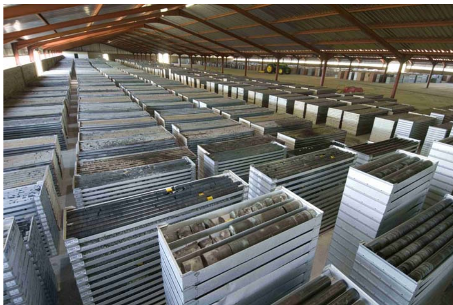
Interior of core storage facility (Potchefstroom) with over 500km of core